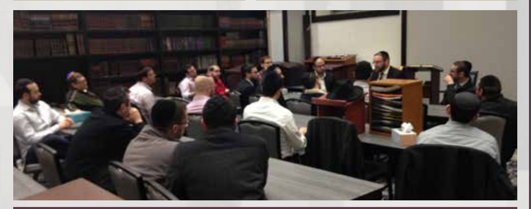
Shalom Bayis Shiur